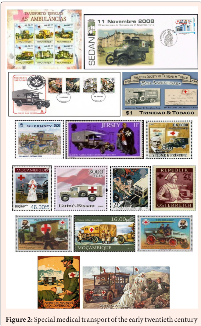
Figure 2: Special medical transport of the early twentieth century