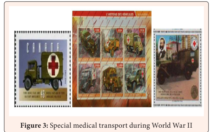
Figure 3: Special medical transport during World War II

The period of World War II and the early postwar period, is represented mainly by military specialized trucks, of different countries and brands, whose task was to evacuate the wounded from the battlefield to the nearest hospitals and to the rear for treatment. A selection of stamps, envelopes, and blocks representing this time period and special medical transport of those years is shown in Figure 3 [3-5].