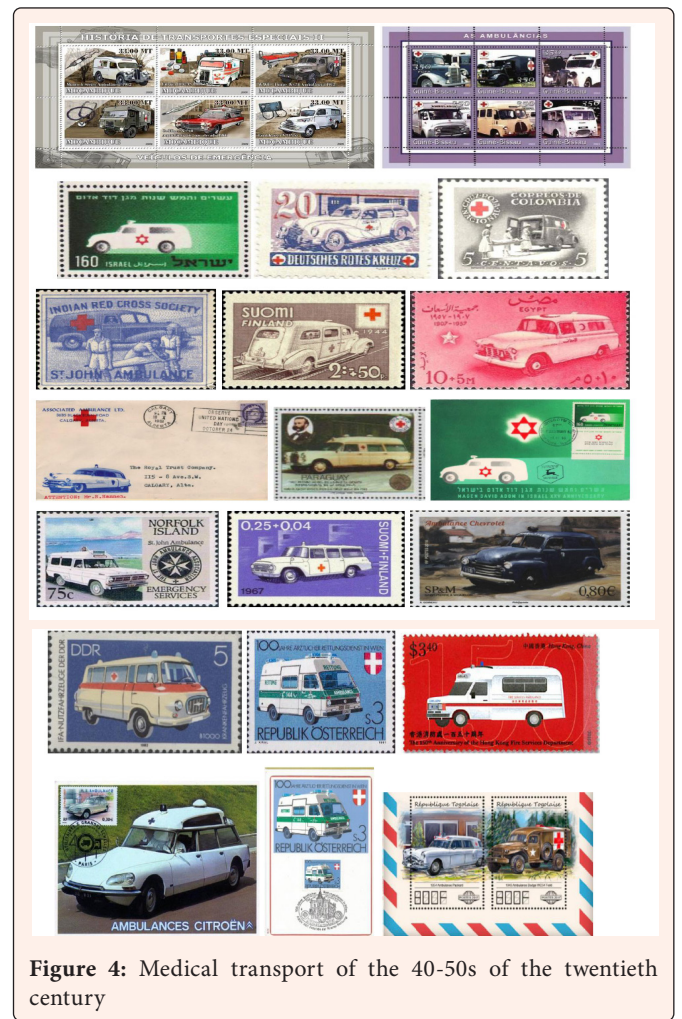
Figure 4: Medical transport of the 40-50s of the twentieth century