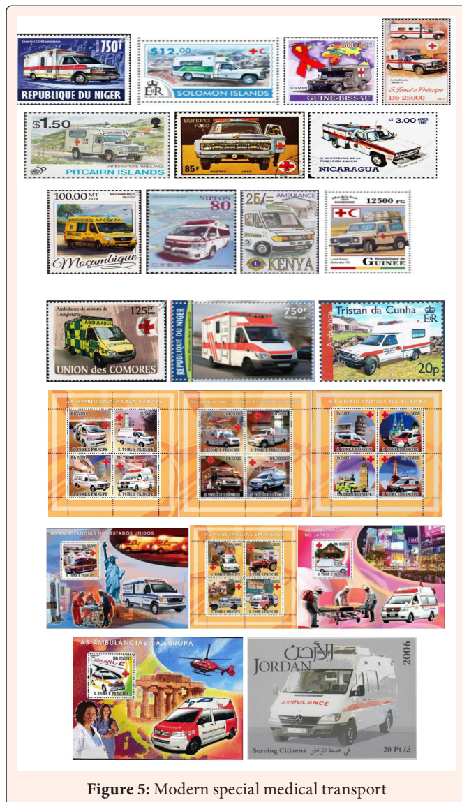
Figure 5: Modern special medical transport

Since the 1960s and 1980s, against the background of the rapid development of medicine, economy, metallurgy and automobile industry, the introduction of new approaches and development concepts, the means of special medical transport were also rapidly changing. Cars for ambulance service, paramedic teams and medical rescue and disaster medicine services became more and more comfortable, of modern models and design, equipped with modern means of emergency assistance, both for the needs of civil medicine and for medical service of the armed forces of different countries. An extensive selection of various models of ambulances and special medical transport, up to the present day, reflected on postage stamps, blocks and envelopes, is shown in Figure 5 [3-5].