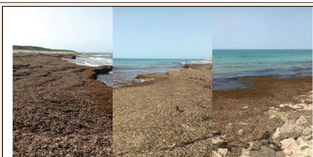
(Figure 3): Sargassum influxes in Punta de Maisí, August, 2024, [14].